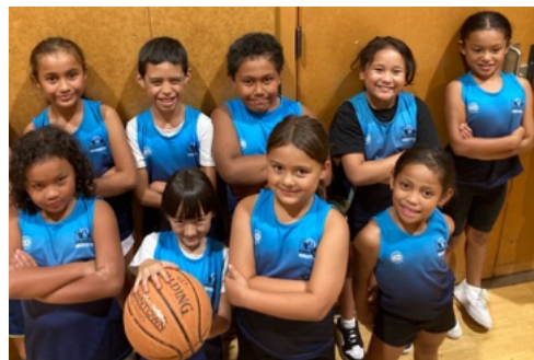
Knighton Breakers Year 3 & 4 Miniball Team

Registrations for year 5 & 6 netball are now open, and close on Thursday 10th April. You can pay via https://shop.kindo.co.nz/app/login or at the office. Registration forms are on our website https://www.kns.ac.nz/newsletter_sets/2-newsletters/years/2025