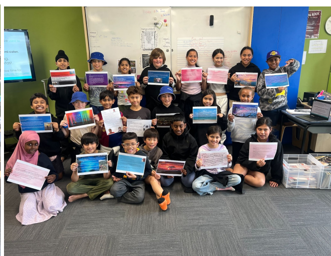
Our pen pals wrote to us a number of times.