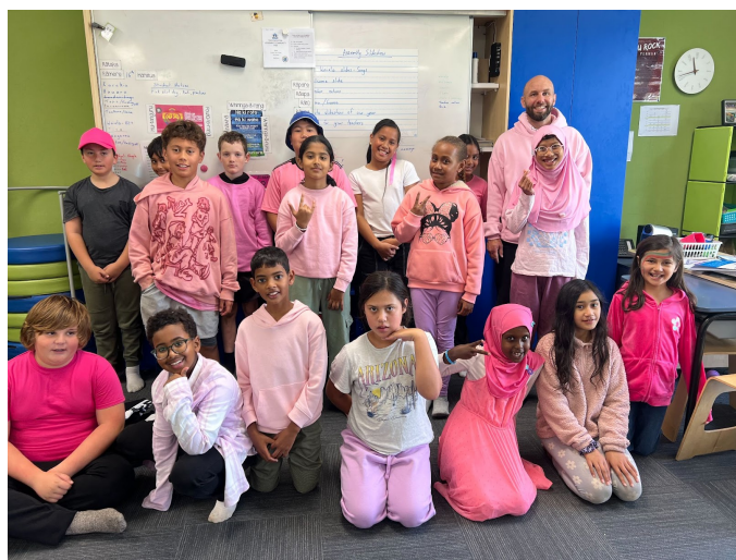
Pink Shirt Day 2025

I hope everyone has enjoyed viewing what we have been doing at school through Classdojo. I will continue to upload a photo every couple of weeks during term 3. If you haven't received a Class Dojo login please let me know and I will arrange one for you.