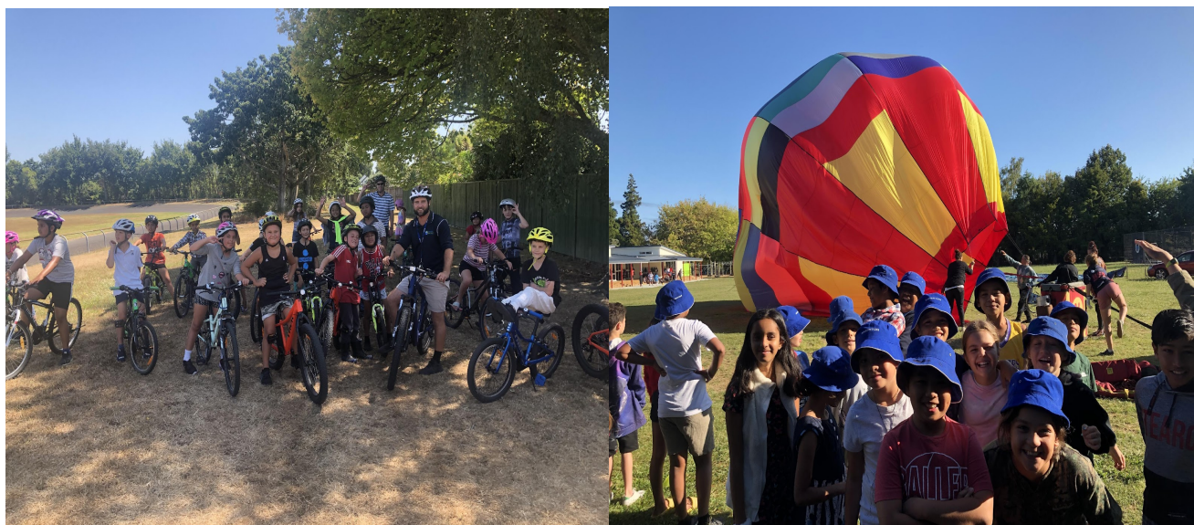
The Hamilton City Council bike safety day had to be one of the highlights of term 1. This was as good as 'Balloons over Waikato' got this year.

Hats are not required to be worn during term 2 or 3. Please put your child's hat in a safe place so you can find it easily at the beginning of term 4.