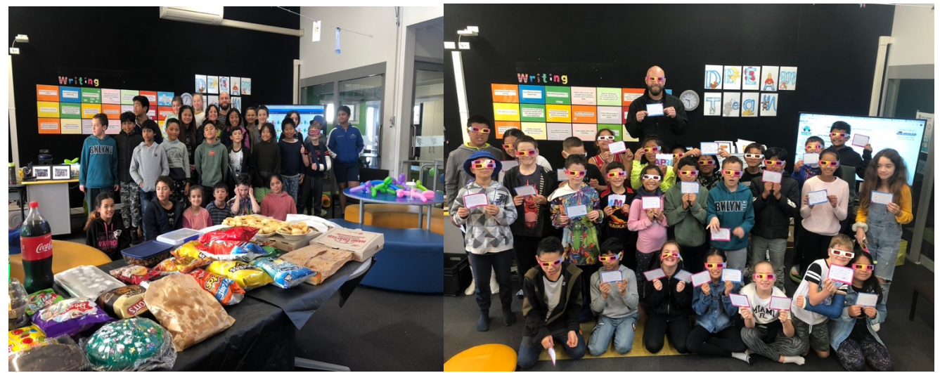
Check out our class party kai! A throwback to the old school, the postcards have arrived from our Christchurch pen pals.

The senior school continues to have maths in our cross-group classes every afternoon. The children are in class groups that suit their learning needs, challenges their thinking, extends their understanding of mathematics concepts and encourages them to work both independently and collaboratively to solve number and word problems.